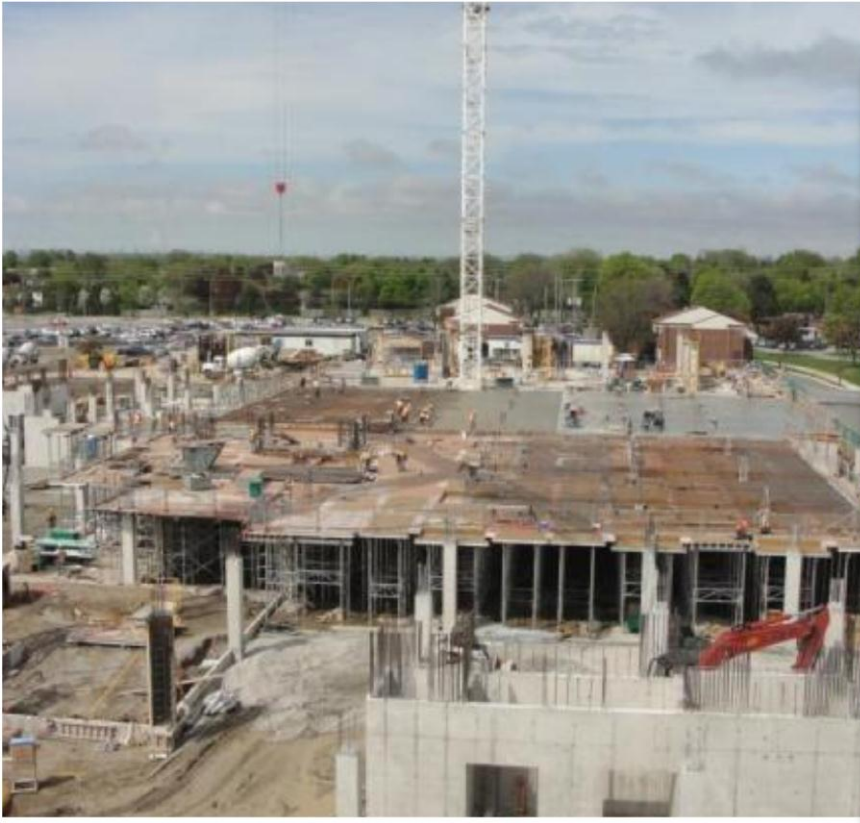
May 2011 2 nd Floor Slab Concrete Pour