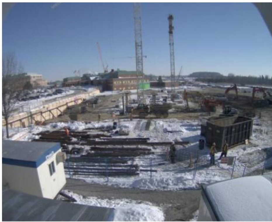
February 2011 Foundation Work