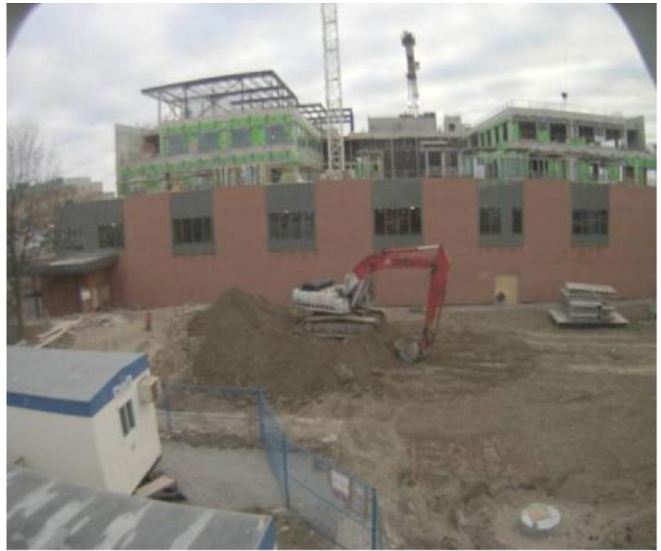
October 2011 Brick and Curtain Wall west elevation