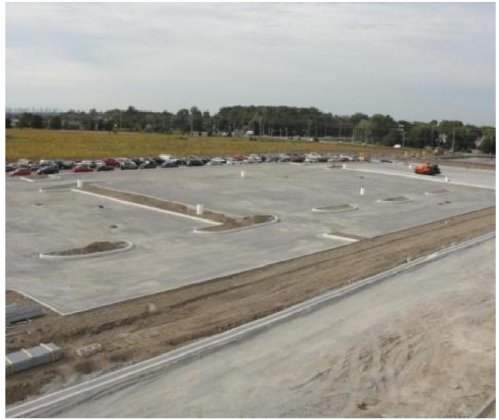
June 2011 South Parking Lot