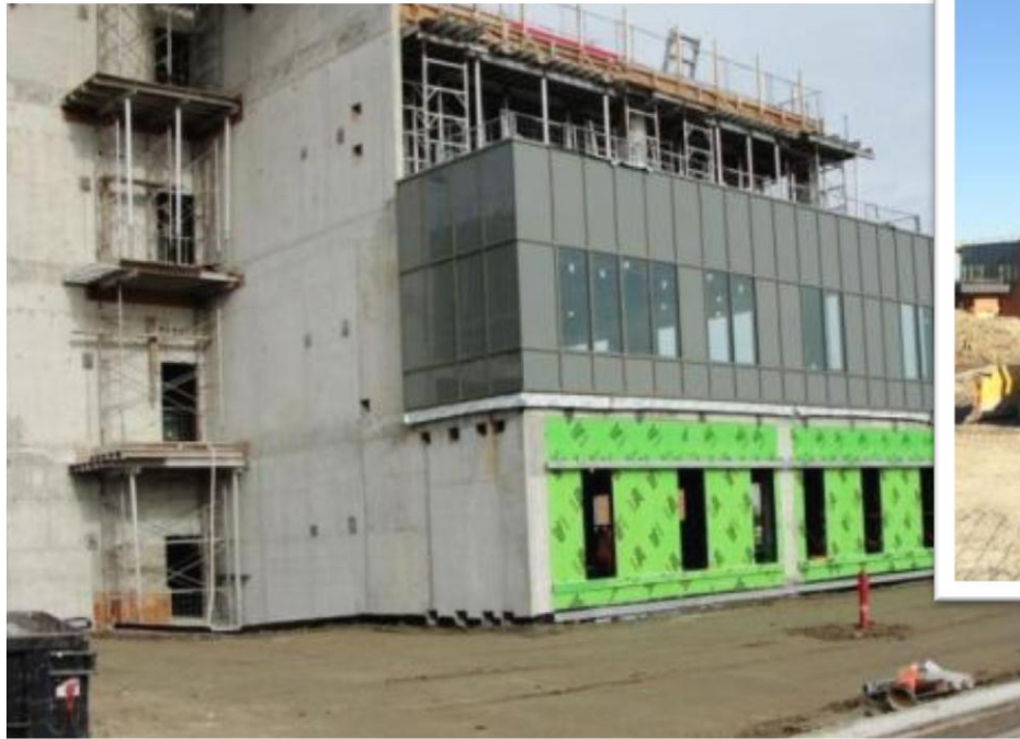
November 2011 South MH Curtain Wall