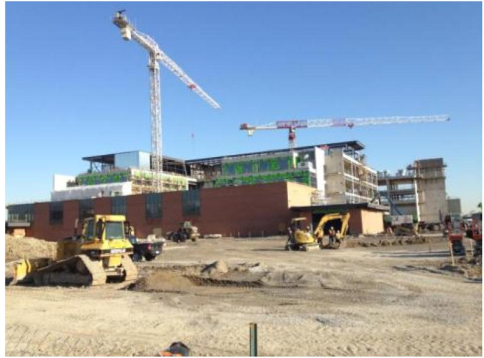
December 2011 West Curtain Wall