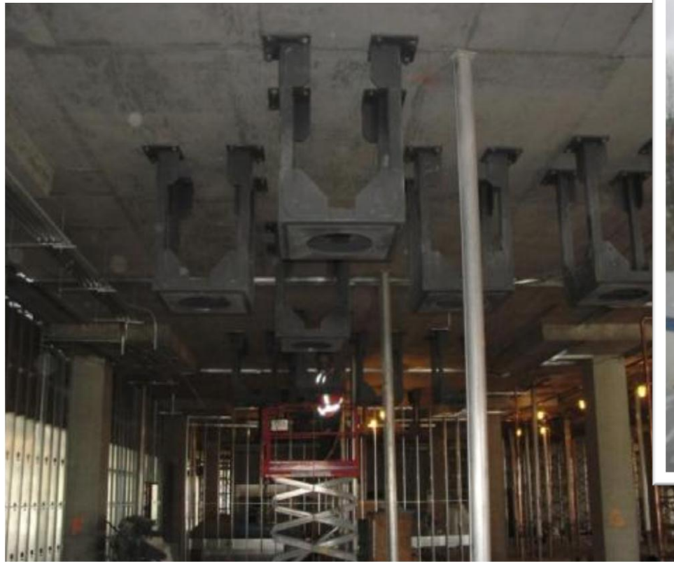
September 2011 2 nd Floor Rough In