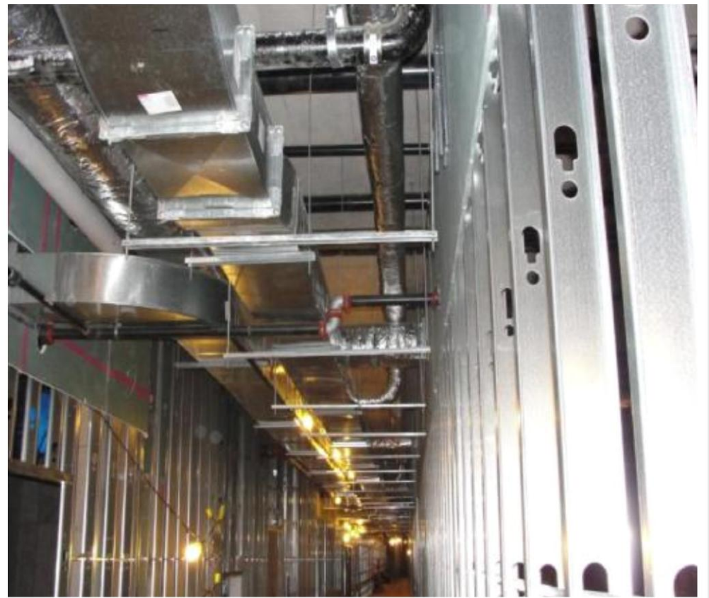
November 2011 2 nd Fl Mech Elec & Studding