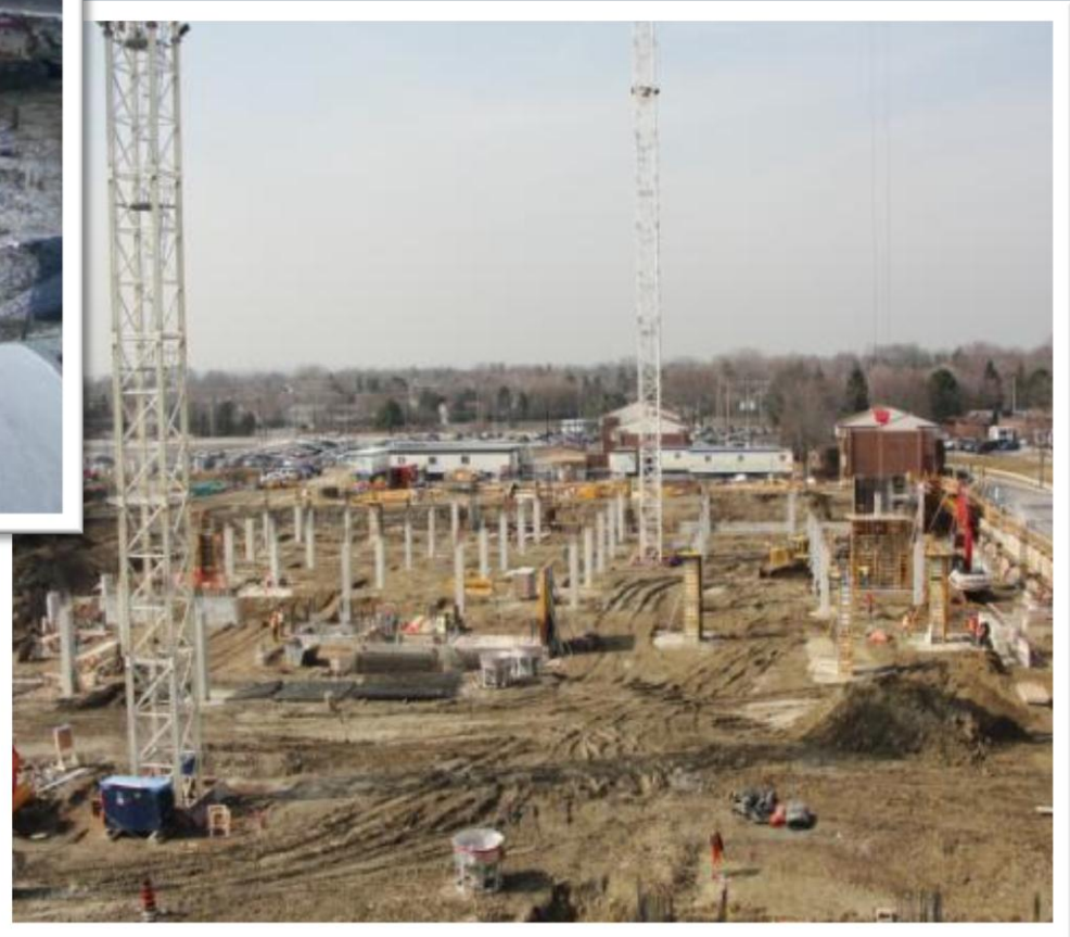
March 2011 Columns to 2 nd Floor