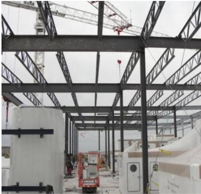
November 2011 Penthouse Mech Equip