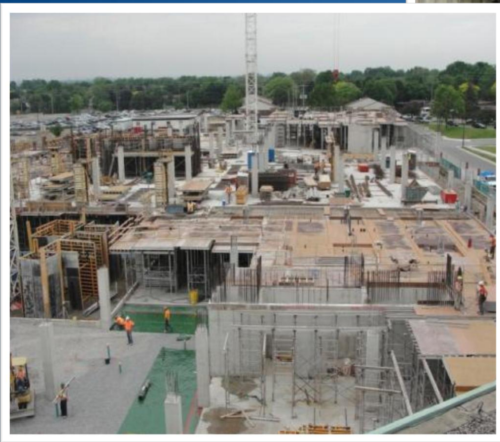
June 2011 2 nd Floor Slab Concrete Pour