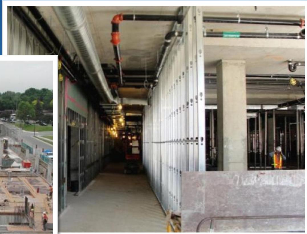
July 2011 1 st Floor Elec, Mech & Studding